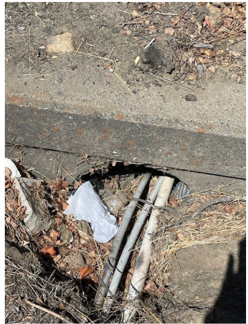
Figure 2: Utility lines in question at location 116.