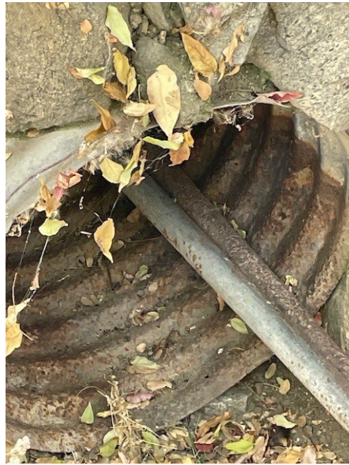
Figure 4: Utility lines in question at location 131.

CleanCA.com | #BeWorkZoneAlert | Twitter | Facebook | YouTube |