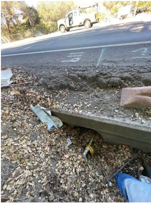
Figure 3: Utility line in question at location 119.