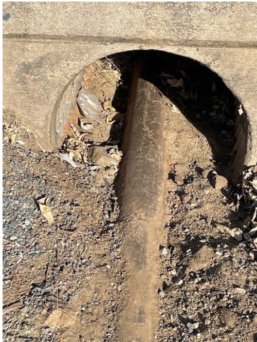
Figure 1: Utility line in question at location 99.